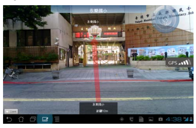
Figure 2: AR View User Interface

We design HTT system to provide an AR-based m-learning platform for the local culture courses. It satisfies the main technology trends of m-learning: location-aware learning, context-aware ubiquitous learning, and augmented reality on mobile devices. Figure 2 is the AR View User Interface. In addition, the AR interface allows the teacher to coach students to recognize geographical location of each landscape.