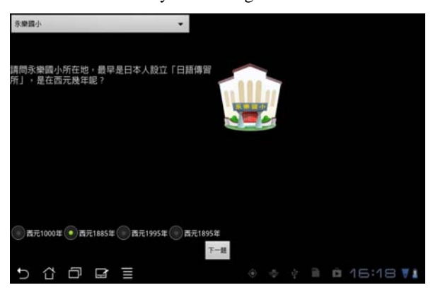
Figure 3. Online Quiz User Interface

provided in the form of Web page and video clips. In order to achieve the scaffolding instruction, a set of quiz is designed for each landscape, as shown in Figure 3. It enhances the interactivity of learning.